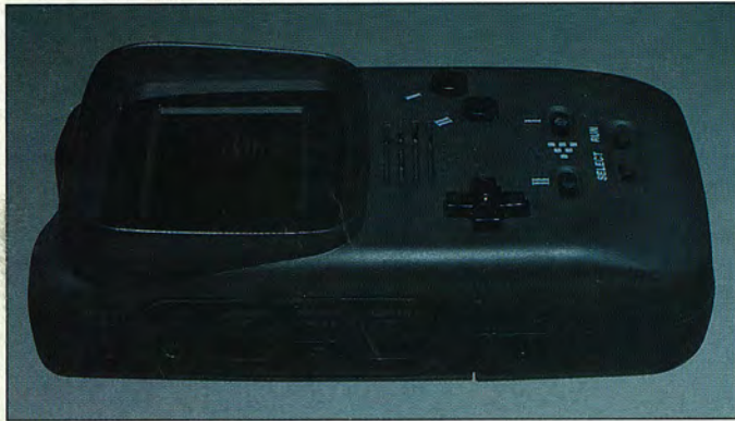
The left-side view of the TurboGrafx-16 portable keeps most of the controls close at hand (from left to right): a jack for off-board DC power, the stereo-headphone jack, a volume knob, a two-position brightness switch and a variable contrast knob.