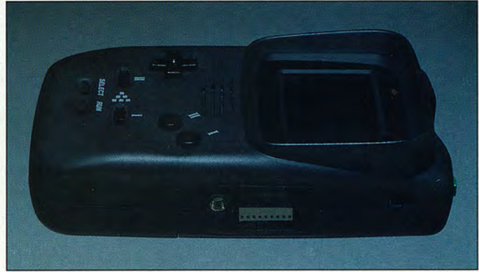
A peek at the right side of the TGP yields perhaps the most exciting feature, a port that will hold the optional television tuner. This device will not only turn the TGP into a fully functioning TV, but also lets you use it as a monitor for other video sources, like a VCR or camcorder.

Speaking of the display, the resolution of the TGP is 312 x 238 for a total of 74,256 dots. This makes for not only a good picture for video-game playing, but also for TV watching. And the TGP won't be limited by available lighting, as is the case with Nintendo's Game Boy. The TGP will be equipped with a florescent back-light with a life span of approximately 4,000 hours of use.