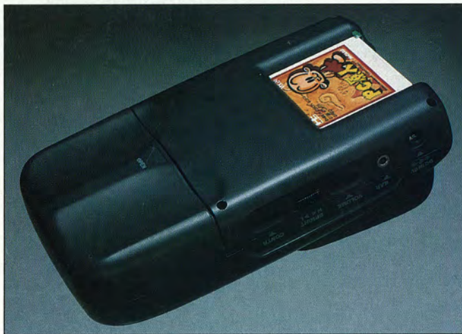
The compact size of the TurboChips makes it easy for NEC to work a portable around them. A slot at the top rear of the TGP holds the cartridge (in this case, the Japanese version of Bonk's Adventure ); the door at the bottom opens to house six "AA" batteries.

My palms are getting sweaty just thinking about it. 🙄